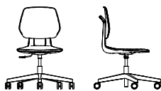
CASHY SPECIAL SWIVEL CHAIR 5A